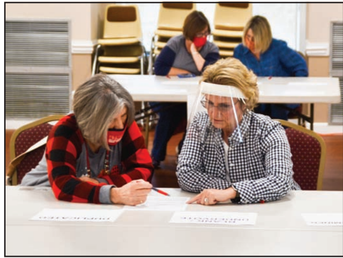
Poll workers in Towns County worked hard Friday to finish their part of the "hand recount" ordered last week by the Secretary of State.

The main purpose of a risk-limiting audit is to "identify potential hacks, malfunctions, or other interference in the voting process," according to the