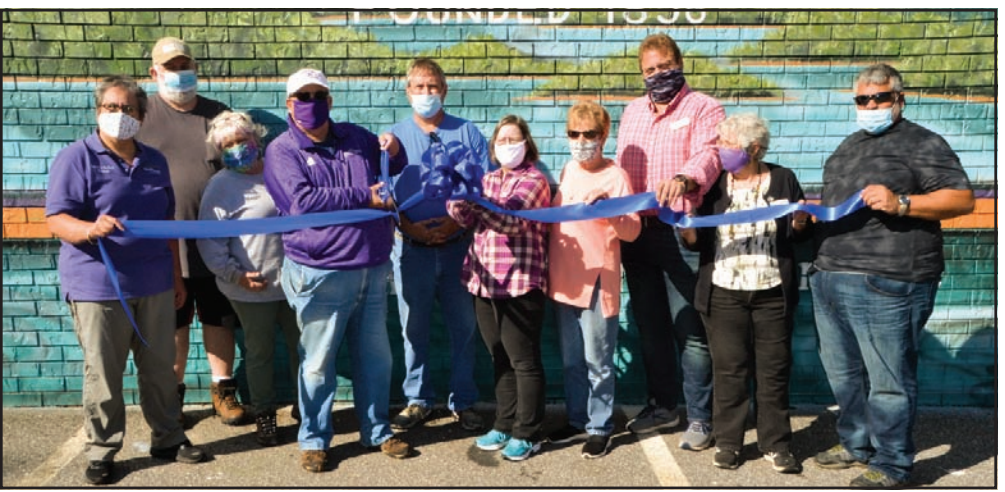
Local stakeholders met for a ribbon cutting highlighting the completion of the beautiful mural on the side of Eagle Mountain Archery on North Main Street.

By Jarrett Whitener Towns County Herald Staff Writer