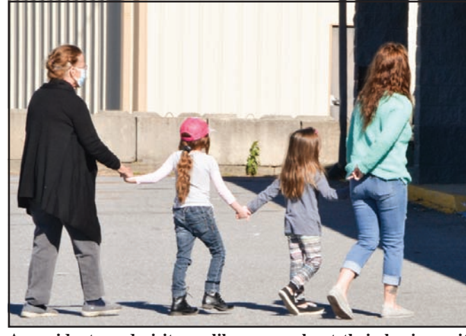
As residents and visitors alike carry about their business, it seems that more and more people are ready for 2021 to get here already.

deal, but this is monstrous compared to that. People treat this one like it is life or death and determines the fate of the world and how it will work. I